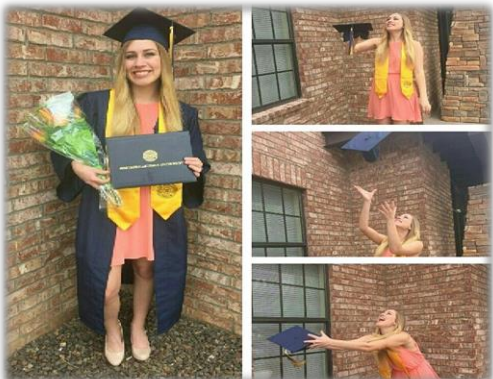
Graduation NAU May 2016