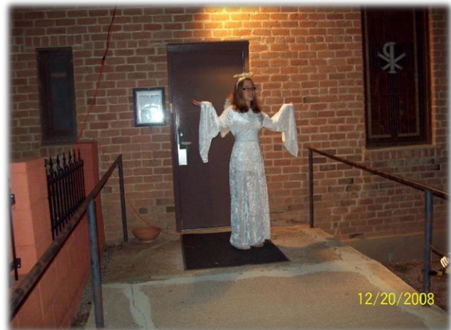
Live Nativity Angel 2008